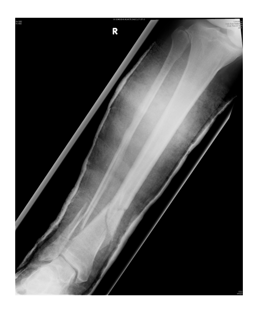
A common trampoline injury